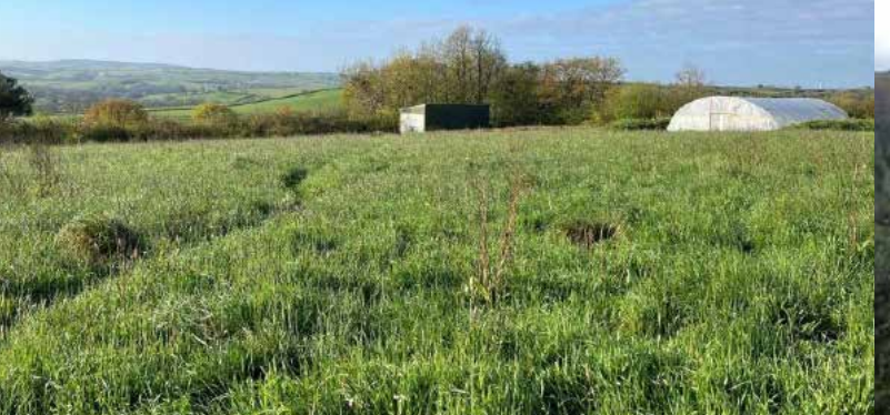
A level and gently sloping pasture paddock extending to just over 2.3 acres with a small range of buildings and polytunnel. South facing with fantastic far reaching views.

Woodland at Herodsfoot Liskeard | Auction Guide Price £5,000 - £10,000 SOLD: £10,000