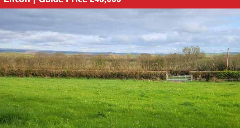
A small parcel of gently sloping pasture land extending to some 2 acres, perfect for amenity or equestrian use. Boasting far reaching countryside views and parish road access.

reaching countryside views and parish roa Holsworthy Farms & Land Department farms@kivells.com | 01409 259547